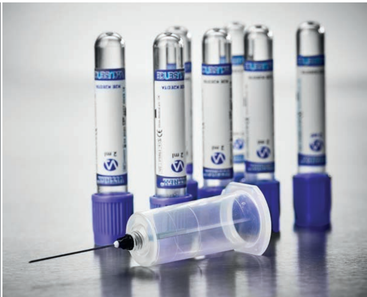
1. Blood Collection Tube